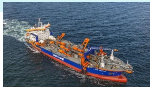
Van Oord Dredger, Vox Amalia