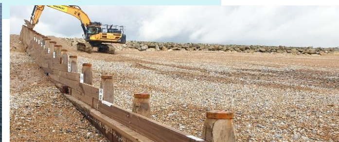
Groynes being constructed at nearby Hythe Ranges